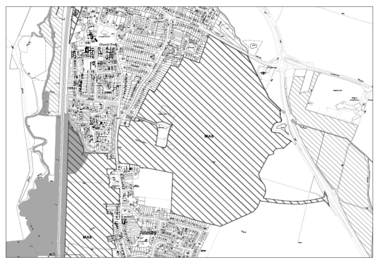
Extract Plan from Site Allocations DPD Proposals Maps (2011)